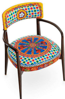
ONLY GRAPHIC VERSION 1 ONLY GRAPHIC VERSION 2